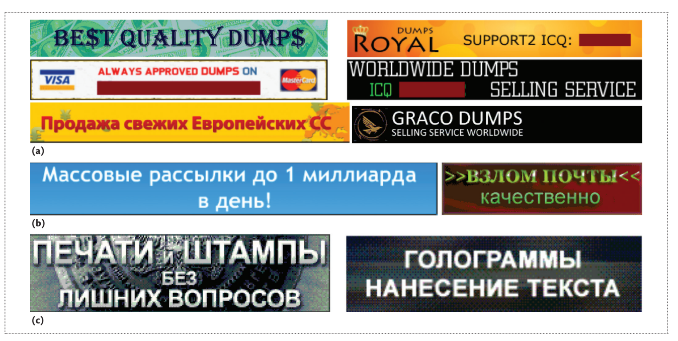
Figure 3. Persistent advertisements. (a) Dumps ads. The image on the bottom left says "The sale of fresh European CC [Credit Card]." (b) Spamming and email account hacking ads. The Russian text on the left translates to "Spam mailings up to 1 billion a day!," and the one on the right means "Hacking mail without advance payments." (c) Seal and hologram ads. The Russian text on the left translates to "Seal and stamp alterations with no questions asked." The text on the right means "Holograms and drawing text."

writing, and our Forum11 data dates back to July 2007. Based on the length of its lifetime, we suspect Forum11 has a reputation in this community and attracts new markets to promote on it.